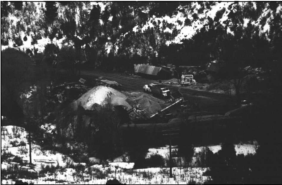
BNSF Grain Train wreck about a mile north of Raton, NM, off I-25 . The hazmat team was cleaning up the estimated 1500 gallons of spilled fuel. The spilled corn was salvaged, cleaned and reloaded into cars for shipment to Iowa. The car bodies on site were laid out for removal.