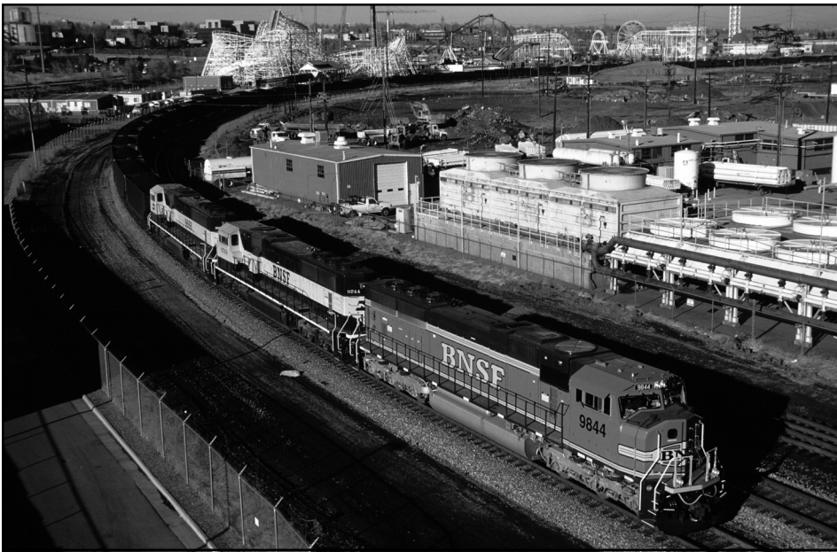
Burlington Northern Santa Fe's (BNSF) newest power from EMD are SD70MAC's (9838-9864) wearing a Heritage II paint scheme, orange, green with yellow stripes/lettering and silver trucks. BNSF 9844 was headed south at Walnut Street, Denver, CO, on December 31, 1997. The train came from the Jacobs Ranch Mine, WY, and is enroute to Smithers Lake, TX, west of Houston, TX, where the Houston Power & Light Parish Power Plant is located.

along with Pacific Overland Express MONTEREY. On the rear of the train were Amtrak express cars (solid green scheme) #70004 and 70001. The passenger cars are all expected to be worked on at Denver Railway Services in Englewood, CO, a Calahan Company.